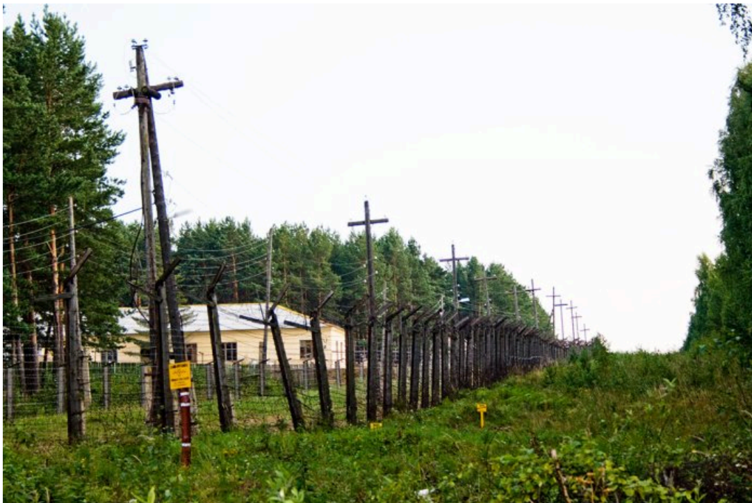
Barbed wire fence at the «border» of the closed city of Ozersk, 2007