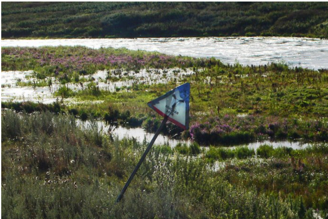
Radioactive danger sign near the Techa River, 2007