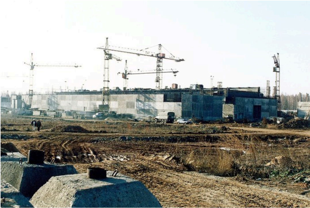
Construction of a storage facility for containers with radioactive materials on the territory of Mayak

background radiation. Notably, in a settlement near Ozersk the contamination had increased by nearly a thousand times compared to August.