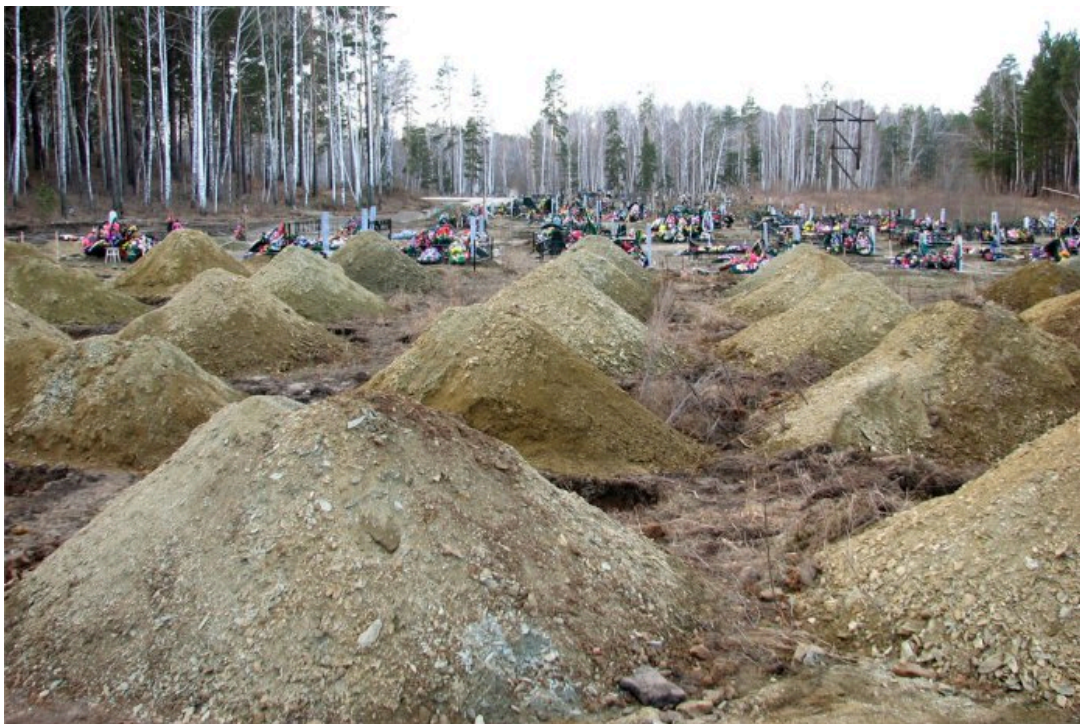
Cemetery in Ozersk, 2007

Despite the social prosperity of Ozersk, mortality in the town significantly exceeds the birth rate. In 2023, the local registry office registered 454 newborns and 1068 deaths. In January of this year, 28 people were born in the closed city, while 126 died; in February — 25 and 79; in March — 25 and 99 people respectively.