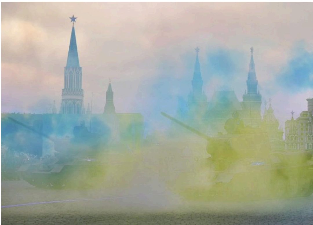
The protest as planned by Danila Tkachenko / Collage by Danila Tkachenko

On May 13 he posted a photoshopped image of what the protest could have looked like.