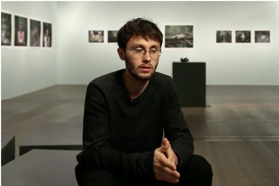
Daniil Tkachenko, 2016 / A still from Suomen valokuvataiteen museo

«I have been working with smoke and fire for a long time. They attract me somehow. I was worried about the centralization of power in Russia. It was a project about decolonization. The death of the village fits into this concept very clearly. But I wouldn't describe the smoke performance as art: it's more about my civic position, it's more like activism, » Tkachenko explains.